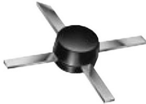
CASE STYLE: VV105